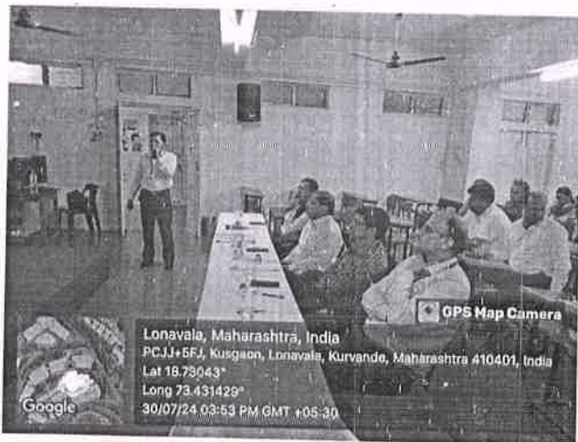
Presentation Continued ....