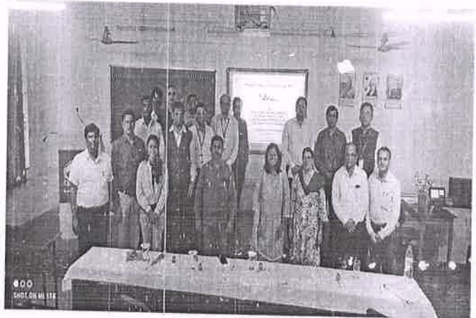
Members of IQAC

Tel: 020-2417-355, 356. email: Principal_sit@sinhgad.edu / aqr.sit@sinhgad.edu SINHGAD INSTITUTE OF TECHNOLOGY Kusgaon (Bk), Lonavala, Pune-410401.